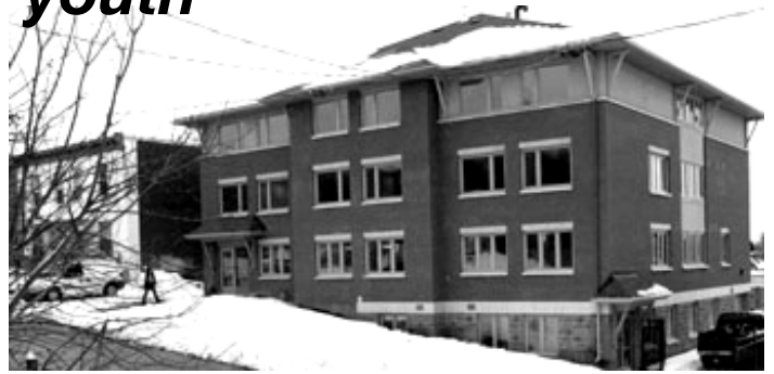
The new Young Women's Shelter will open Spring 2006

For the past ten years there have been two youth shelters in Ottawa: the Young Women's Emergency Shelter operated by Youth Services Bureau (YSB) and the Young Men's Shelter managed by the Salvation Army. Both offer emergency short-term shelter to youth aged 12 to 20, offering a wide range of supports including supportive counselling and advocacy.