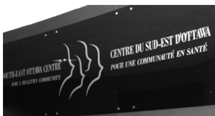
Housing Loss Prevention services at South East Ottawa Centre for a Healthy Community

Families and individuals can lose their housing for any number of reasons: fleeing abuse, losing a job, or having an income too low to stay in suitable housing. Some are at risk because of mental illness, or substance use problems, or lack the life skills or ability to live on their own.