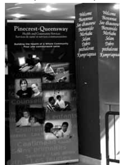
Housing Loss Prevention services at Pinecrest-Queensway Health and Community Services