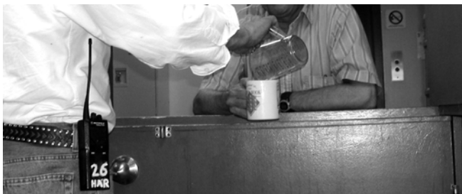
Harm Reduction Program at Shepherds of Good Hope

The study concludes that the term 'hard-to-house' should be put to rest. It shows that people who are homeless, even if they have complex needs and a long history of living on the streets, can be successfully housed in permanent housing if they are given the right supports – as needed and wanted. If solutions can be found to end homelessness for this population, then key elements that distinguish the case studies, such as housing first and a client-centred approach, can be applied to end homelessness for others who find themselves without a place to live.