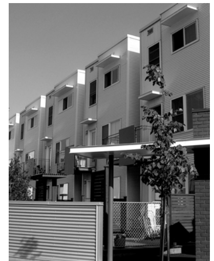
CCOC's award-winning 2005 non-profit development on Richmond Road

Potentially 208,000 dwelling units could be created in the urban area of Ottawa through this intensification initiative, which has proven to be successful in other Canadian cities.