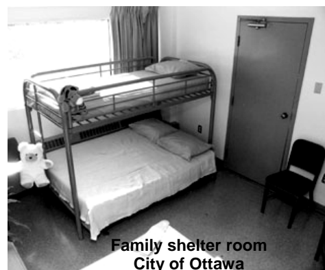
Family shelter room City of Ottawa

The risk of homelessness remains very high in the Ottawa area for a large number of individuals and families. Overall, we would grade the progress in reducing homelessness in Ottawa as a "C+" reflecting some very small gains.