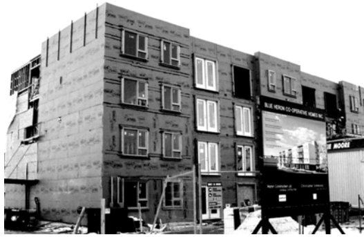
Blue Heron Co-op, the first in 10 years, is a mixed-income project in the West End